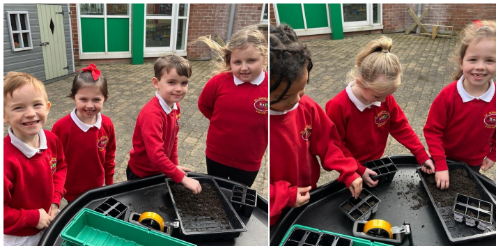
Gardening in P1/2